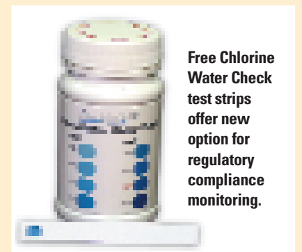
Free Chlorine Water Check test strips offer new option for regulatory compliance monitoring.

optical system based on a special tungsten lamp and a narrow-band interference filter that allows accurate and repeatable readings.