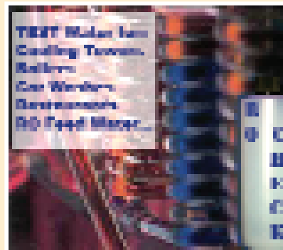
Package tests feed water for commercial and industrial applications.

This testing package from National Testing Laboratories, Ltd. (write in