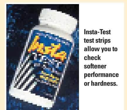
Insta-Test test strips allow you to check softener performance or hardness.

Free Chlorine Water Check test strips from Industrial Test Systems, Inc. (write in 1193) offer regulatory compliance monitoring for municipalities. The test strip received recommendation from the U.S. Environmental Protection Agency (EPA) for drinking water compliance monitoring. EPA's proposal will be made in an upcoming rulemaking that will be published in the Federal Register. Per the proposal, Free Chlorine Water Check will be treated as equivalent to other free chlorine test kits, meaning that states will have discretion to approve their use per authority at 40 CFR 141.74 (a)(2) in regulatory monitoring.