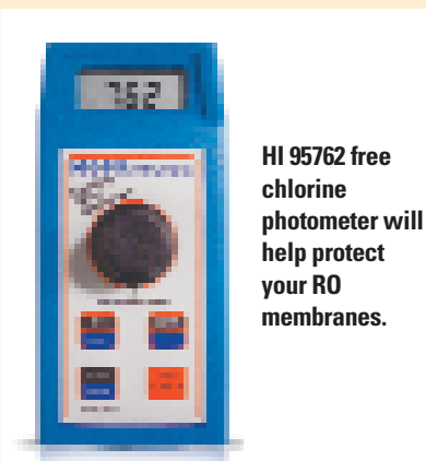
HI 95762 free chlorine photometer will help protect your RO membranes.

1190), originally was designed to test feed water going into reverse osmosis systems to prevent failures. Test parameters also make it suitable for testing water used in car washes, cooling towers, boilers and restaurants. Checked contaminants include calcium carbonates, sulfates, barium and silica.